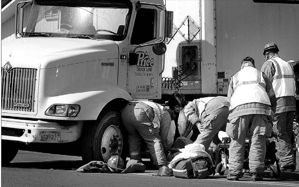
Emergency personnel work on the victim of a crash Wednesday afternoon in the 1700 block of West Crawford. A truck pulling out of parking lot collided with an Abilene motorcyclist.