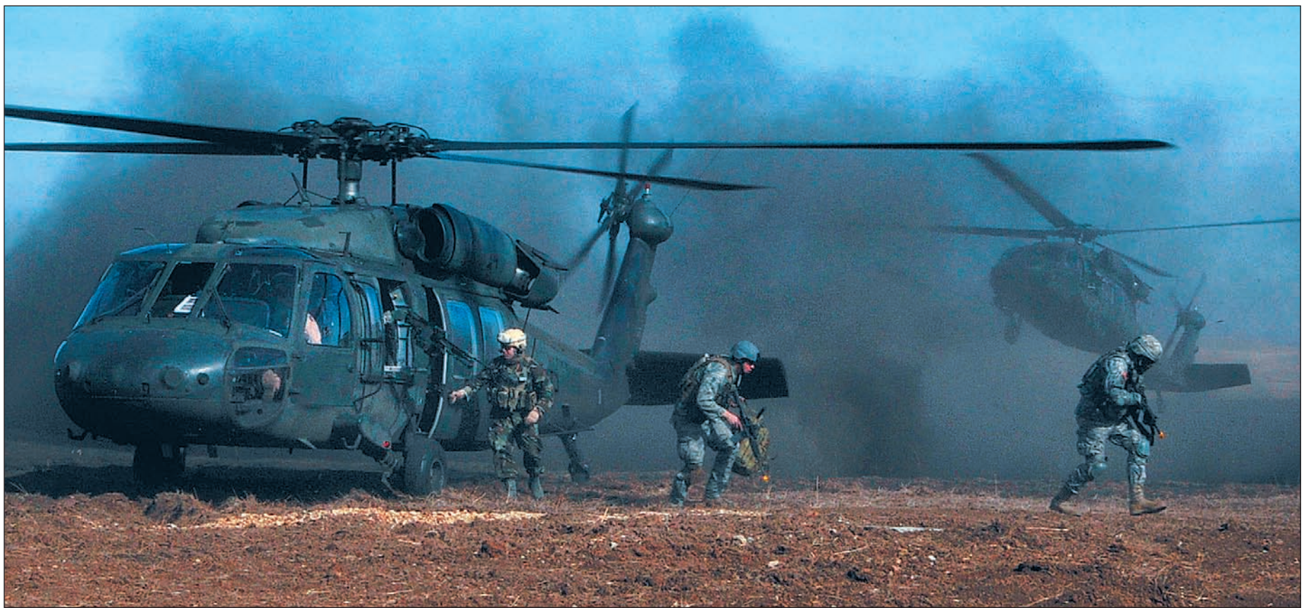
Blackhawk helicopters unload National Guard soldiers Wednesday morning at the Smoky Hill Air National Guard Weapons Range for a search-and-rescue training mission.