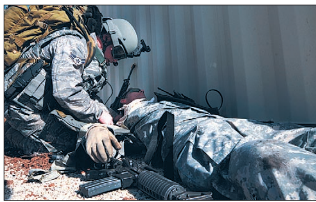
A National Guard soldier tends to a mock casualty during a training mission Wednesday morning at the Smoky Hill Air National Guard Weapons Range.